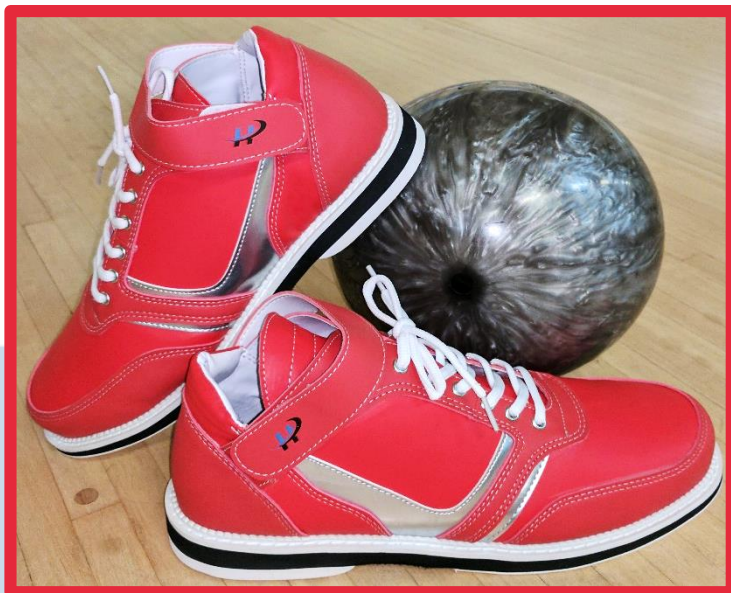
RIPPIN REDS Model# HMRIRE Available: LH & RH Men's Size 8 – 14 Retail: $99.95