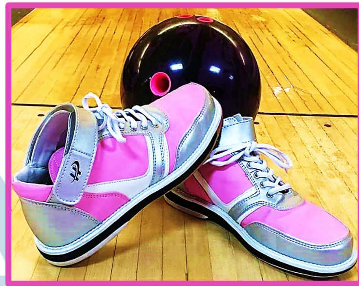
THE CURE Model# HMTHCU Available: RH ONLY Women's Size 5 – 12 Retail: $99.95