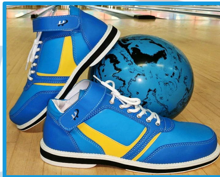
BLUE THUNDER Model# HMBLTH Available: RH ONLY Men's Size 8 – 14 Retail: $99.95